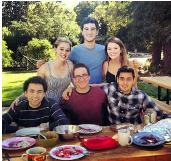
Students enjoy brunch outside Hammarskjöld, a co-op residence for international students.

“I grew up in a war-torn area with a high rate of human rights violations. My dream is to use my knowledge and abilities to reduce poverty. I find myself fortunate to be an undergraduate at Stanford and feel very privileged to receive the Westly Scholarship Fund.”